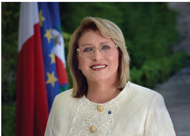
Her Excellency Marie-Louise Coleiro Preca President of Malta

It is indeed an honour for Malta to be hosting the first Women's Forum as part of the Commonwealth Heads of Government Meeting. Convening a Women's Forum shows the Commonwealth's commitment to giving recognition to the role of women in society today, and should highlight the opportunities for the often untapped potential of women to the socio-economic agenda and their competence as leaders. The empowerment of women is adamant to the development of an equal and just society throughout the world.